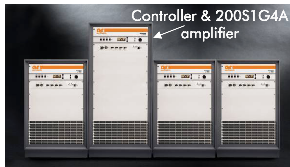
Figure 2: 700S1G4

When combining both the 200S1G4A and 240S1G3A's the controller is housed inside of one of the amplifiers. Each amplifier rack can easily be separated out to be used independently if needed.