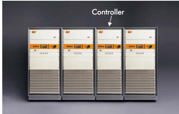
Figure 1: 3000W1000

When combining the 1000W1000C amplifiers the controller is housed in a separate cabinet. Each amplifier rack can easily be separated out to be used independently if needed.